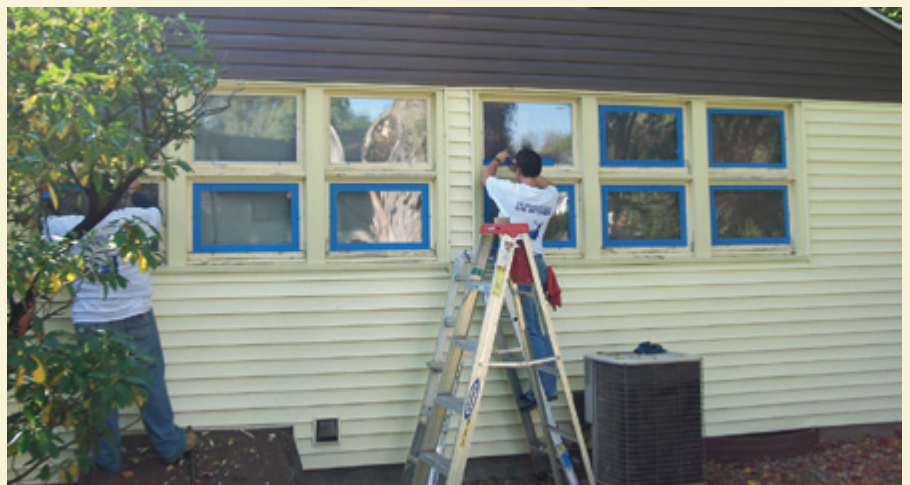
Volunteers from The Hartford paint one of CCARC's group homes for United Way's Day of Caring.