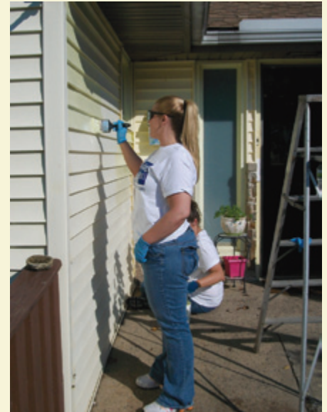
Volunteers from The Hartford paint one of CCARC's group homes for United Way's Day of Caring.

Thank you to the United Way for choosing CCARC's project at the Sy Birnbaum home and to all the volunteers from The Hartford who spent their day improving the lives of people with disabilities. We look forward to next year's Day of Caring!